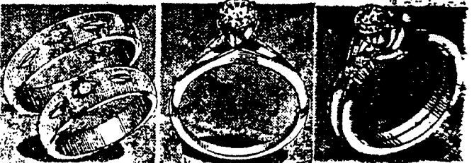
Diamond Bands $125 pr.