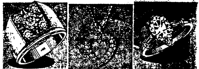
5 diamonds for the male — $119